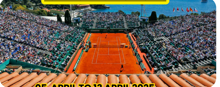
05 APRIL TO 13 APRIL 2025