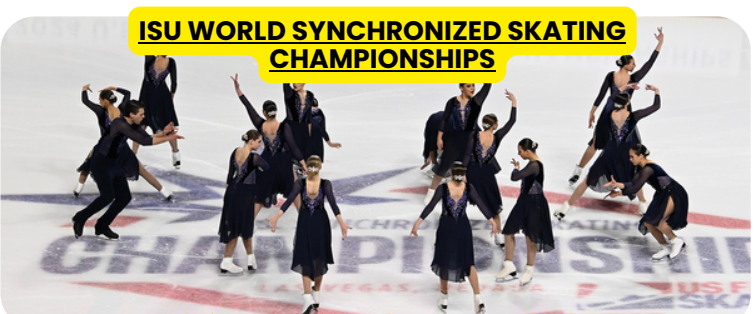
04 APRIL TO 05 APRIL 2025